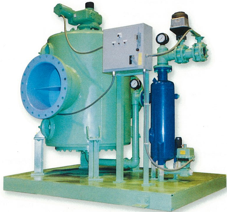
R.P. Adams skid-mounted Poro-Save Backwash Recovery System on 17,000 GPM Strainer.

The Poro-Save System incorporates a high efficiency separator on the backwash outlet of the strainer system. The separator receives the backwash stream and retains the solids in the collection chamber of the separator.